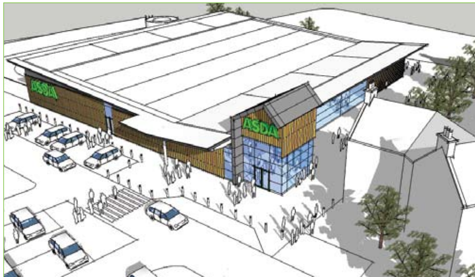
Sketch of proposed development

We achieve this by reducing our environmental impact and those of our suppliers and passing these savings on to our customers. We have reduced the amount of energy needed to run our stores and our store in Armadale will use 48% less carbon than a 2005-model store. We will also strive to achieve a BREEM 'very good' rating, which is a recognised benchmark in 'green' buildings.