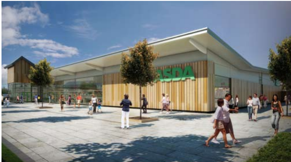
Artist's impression of the proposed store

We really want to hear your comments and suggestions on our proposed changes and would appreciate it if you could complete the attached comment card. You can return it to us at our exhibition or use the freepost address on the card. It is important to note that this is not a consultation on the principle of development, which has already received planning consent.