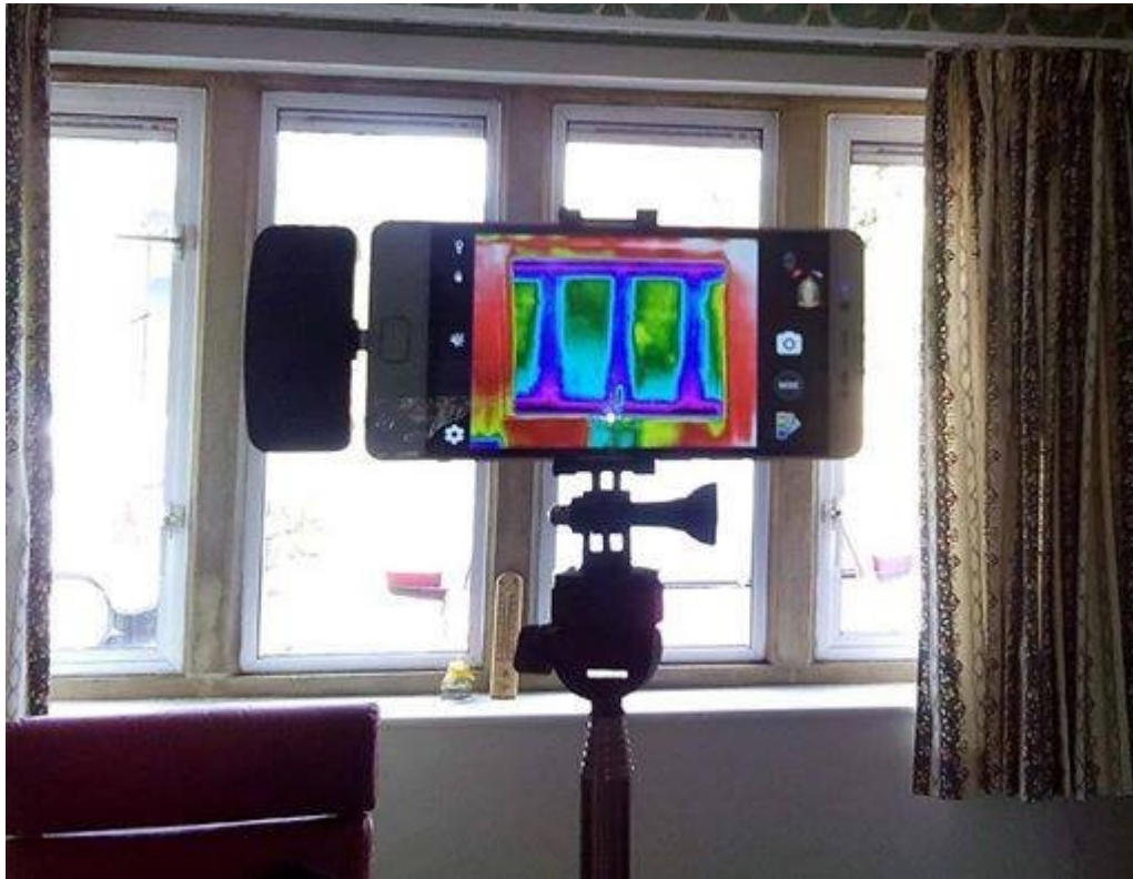
Flir One thermal imager attached to a mobile phone