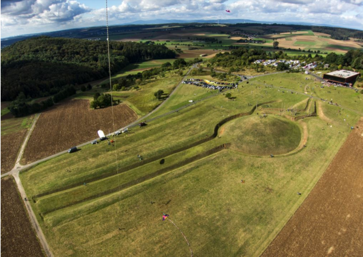
Glauberg: https://en.wikipedia.org/wiki/Glauberg photo by Jim Knowles